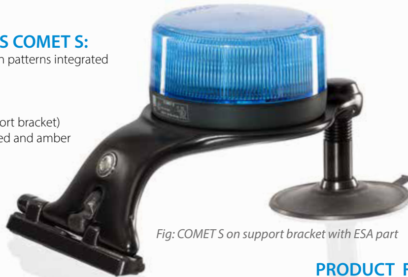
Fig: COMET S on support bracket with ESA part