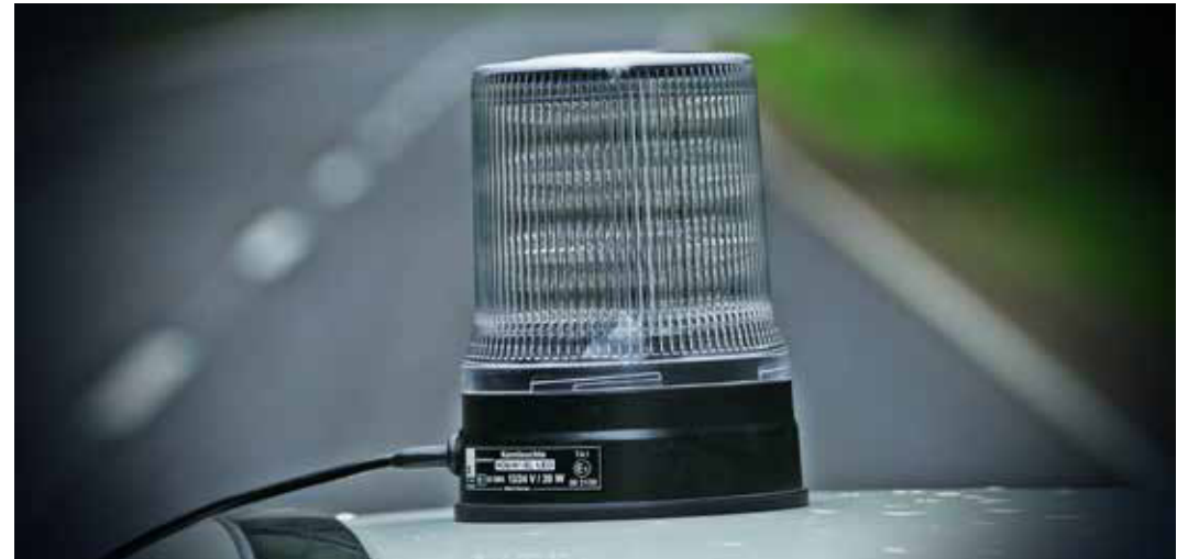
Fig. Movia - SL

The bicoloured beacons MOVIA - SL and COMET LED can be switched between blue and amber. The blue warning signal is used to clear a path on the way to the destination. The beacon can be switched to amber at the destination in order to act as a warning signal to secure the area.