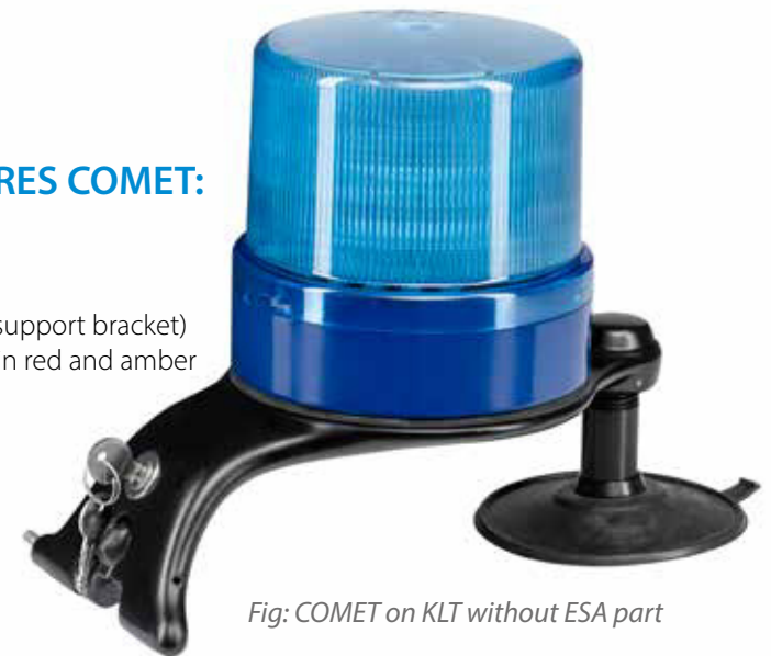
Fig: COMET on KLT without ESA part